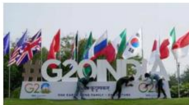
The concerns have grown after two G-20 ministerial meetings in July ended without joint language on a number of key issues.

Impossible to reconcile According to a source involved in the negotiations, G-20 officials pushed for a resolution for hours, dis-