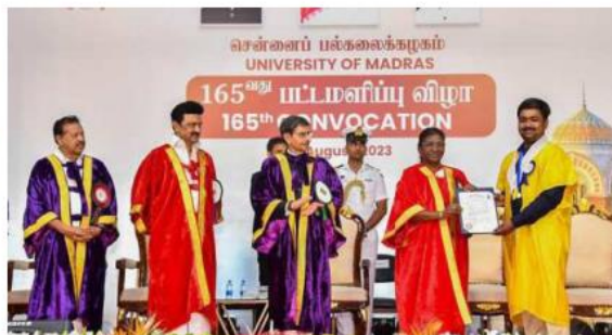
President Droupadi Murmu handing over the degree certificate to a student during the convocation of the University of Madras. CM M.K. Stalin, Governor R.N. Ravi and Minister K. Ponmudiyar are seen.

Noting that 50% of the 1,85,000 students at the